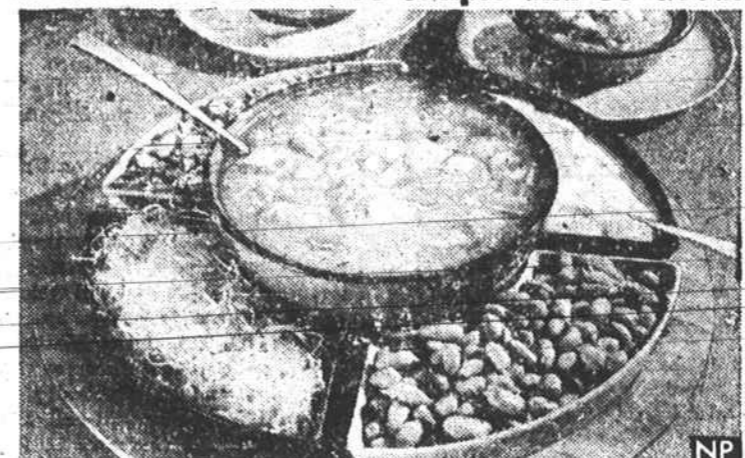
Apple Sauce Buffet

COME ONE, COME ALL and help yourselves to this dessert! Apple Sauce Buffet is so simple, it belongs in the "why didn't someone think of this before" category. And it's so good tasting, everyone will enjoy it.