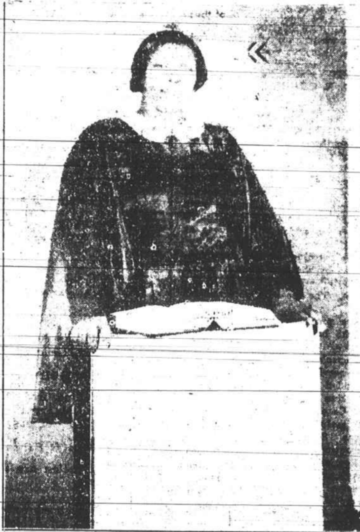
Of Cleveland, president of the Church of the Living God, who is reported to have healed the sick throughout the nation in her various personal appearances and through "healing" handkerchiefs and aprons sent all over the country on request.