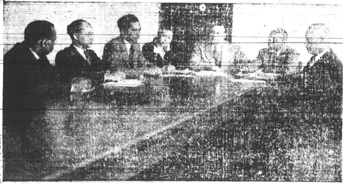
Members of the Executive Council of the National Student Health Association were here at Dillard university last week to plan their program for 1943.