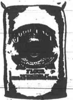
Made in Columbia