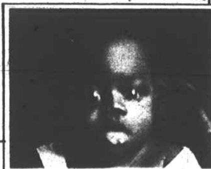
A KNOCKOUT—"Baby Mott," whose parents live on Turley St., shows all signs of health in those limbs which no doubt are the direct result of the child's parents regularly using the "20 per cent richer" FOREST HILL milk! For your health's sake start using FOREST HILL milk today.