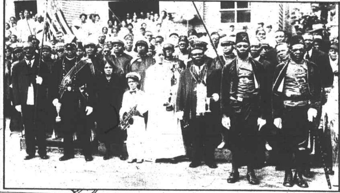
MOST WORSHIPFUL ST. JOHN'S GRAND LODGE, A. F. and A. M. of Louisiana, assembled for the corner stone laying at the Pilgrim Rest Baptist Church in New Orleans.