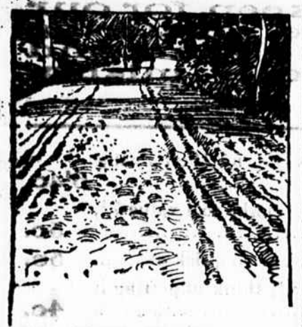
HARD ON THE HORSE.

These street railways, or electric traction roads, are not to be ignored by the good roads workers. They must be studied for the purpose of determining the effect they will eventually have upon highway travel, whether toward increasing or decreasing its volume or as reducing the length of haul by horses and wagons and changing its direction.