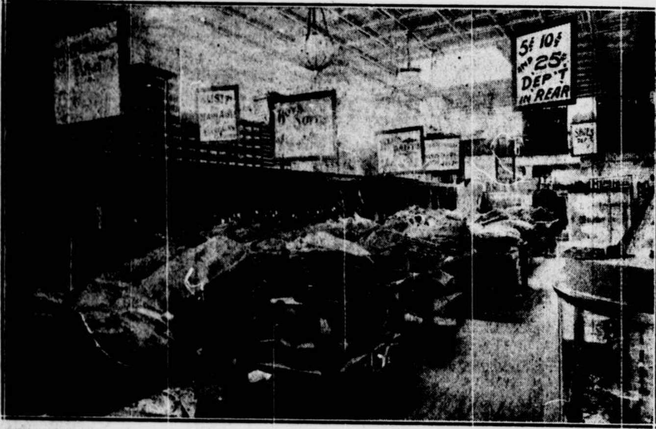
"A suit for every man and boy"—suits that have looks and wearing qualities—the only difference being the price, cheaper by $5.00 to $10.00 than what you have been accustomed to paying. Overcoats and extra pants the same way.

This is by far the largest clothing department in the city of Sumter and when you buy your clothing here you have the satisfaction of knowing that your clothes are right in prices as well as style and quality.