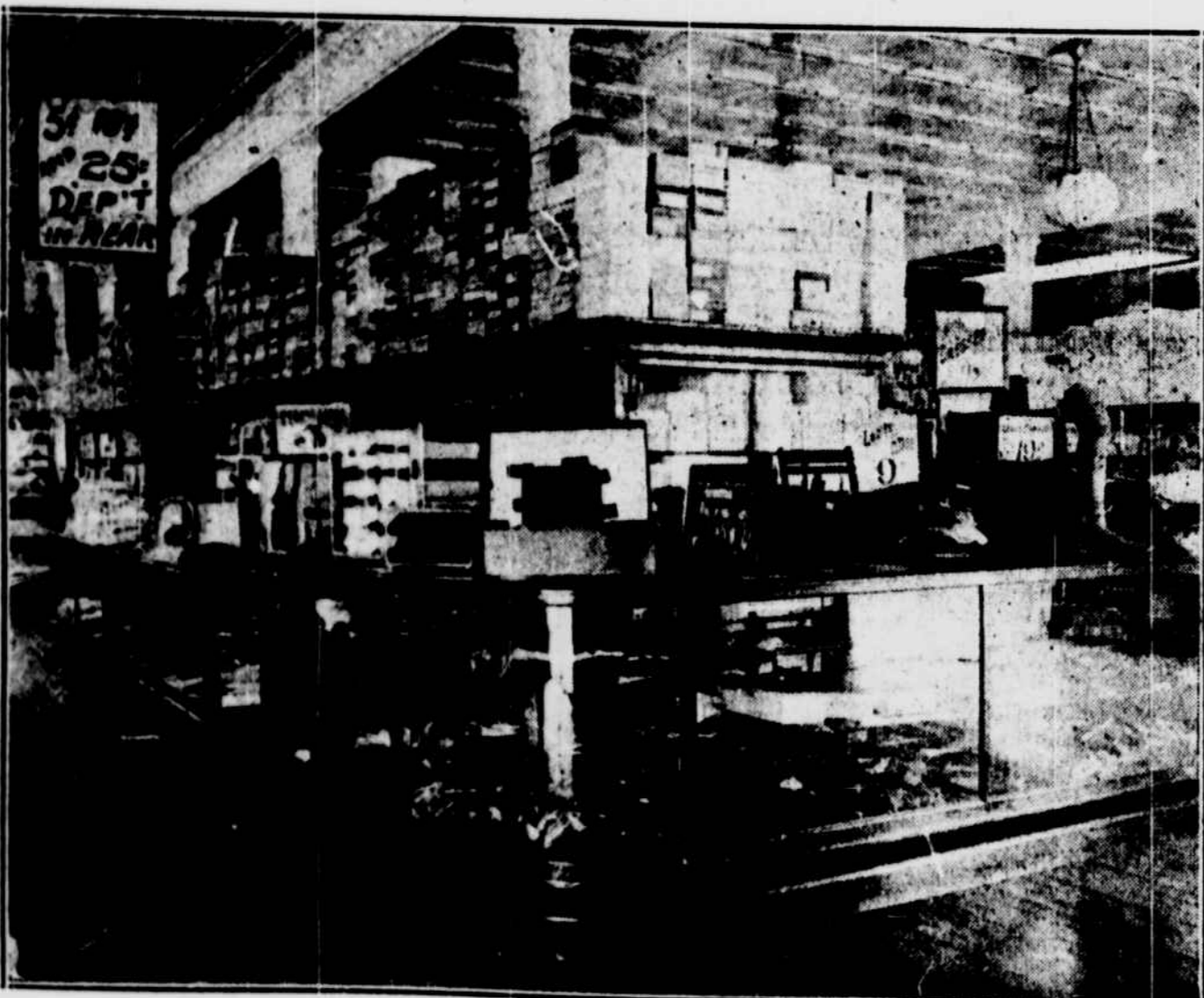
Every man who takes an interest in his appearance should "get next" to this department for his furnishings. Just ask for what you want and you get it for less than you are accustomed to pay.