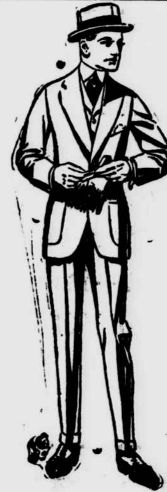
All of the Very Latest Styles

Boys' Overcoats in all styles. Good heavy coats for this cold weather. Birthday Special... $1.98