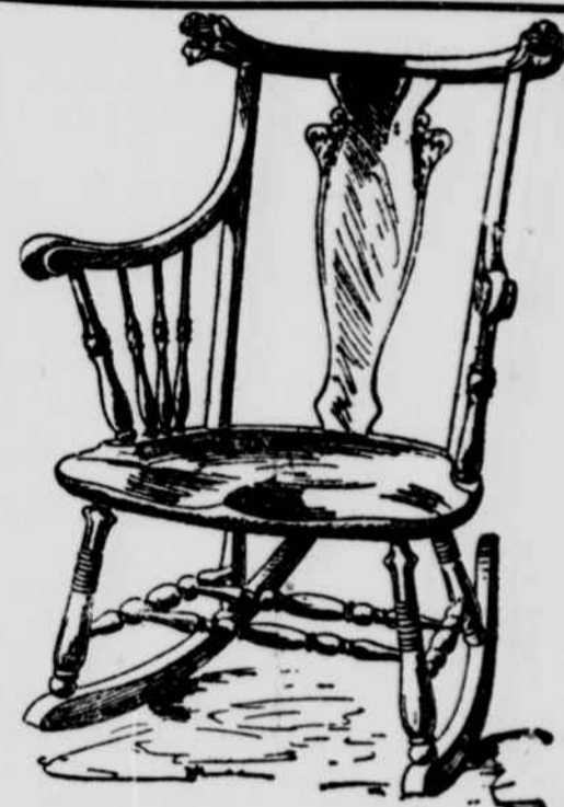
This $4.50 Mahogany Finished Parlor Rocker, with Roomy Saddle Seat, Sale Price, $1.95.