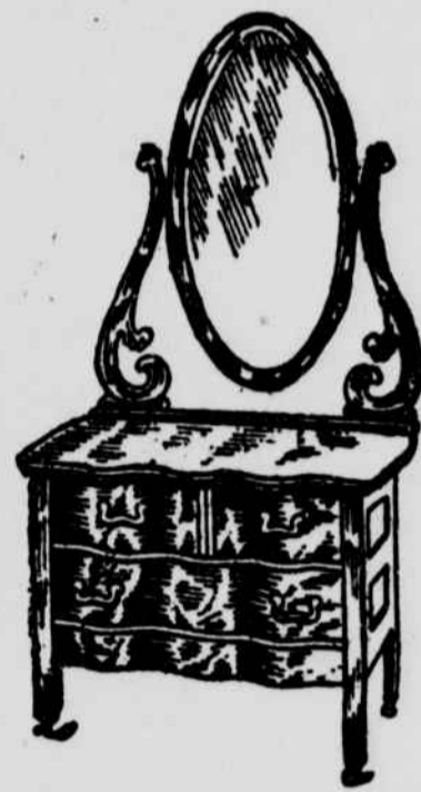
$25 Princess Dresser Sale Price $11.35

The Avalanche of Spectacular Bargains Begins