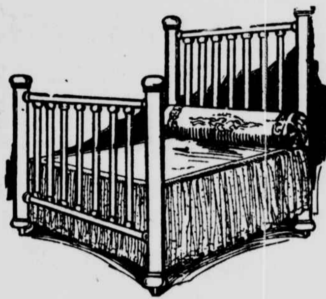
This handsome Brass Bed, $25.00 Value $12.25 Sale Price --