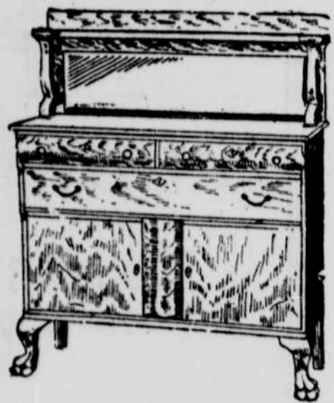
This Buffet in Qt. Oak, Hand Polished, $35.00 Value, Sale Price $15.65

until this date and hour and no goods sold beforehand under any circumstances