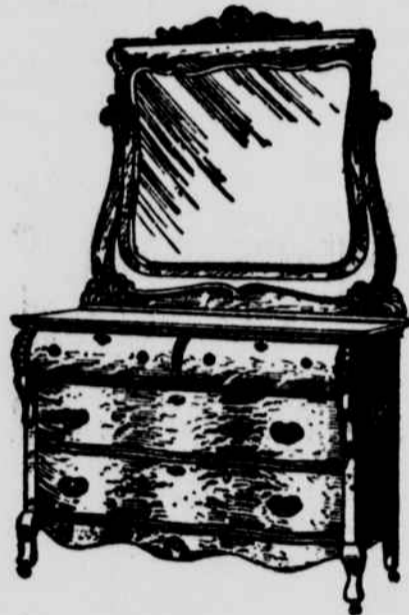
This $20 Oak Dresser, Sale Price, $8.65.