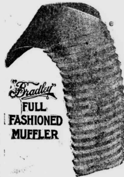
Bradley FULL FASHIONED MUFLER