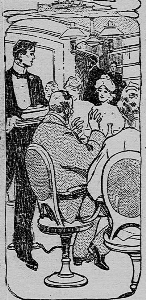
Iris could not help noting his strange behavior.

Every Facility For the transaction of business is afforded those who deposit their money with The Sumter Savings Bank, Important papers can be drawn up and signed in a private room set aside for use of our clients and any information desired will be cheerfully furnished by the management. Savings deposited here draw interest at the rate of 4 per cent per annum. $1.00 will open an account and secure a bank book.