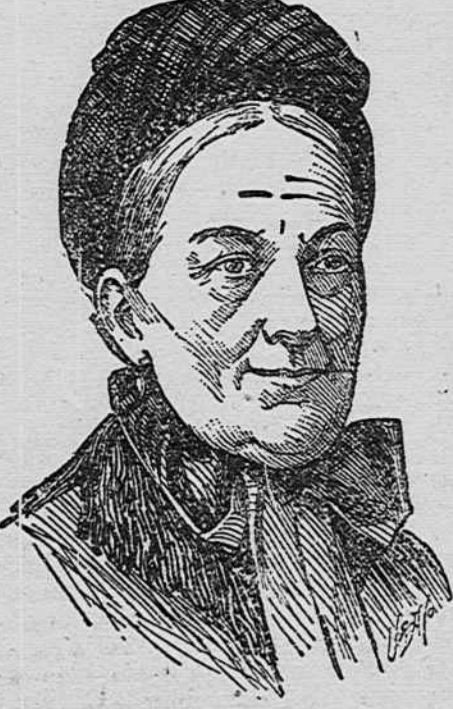
have been snatched from a consumptive's grave by