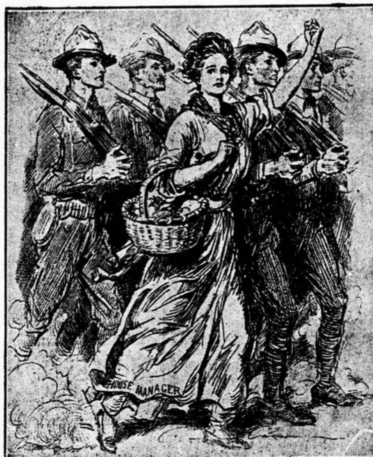
(Copyright by Life Pub. Co.) Courtesy of Life and Charles Dana Gibson.

The American House Manager is today a member of the army that is fighting to save democracy in the world. More than 11,000,000 managers of American homes have enlisted for the duration of the war and pledged themselves to support the fighting men by the way they buy, cook and serve food. Food will win the war, and these women will help to win it. America must send food to Europe. The armies cannot hold out if we fail to send it. Only certain foods