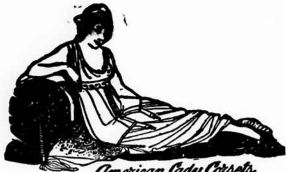
American Lady Corsets

to suit all ladies. A trial is all we ask.