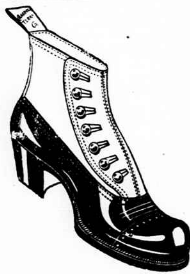
This is one of our favorite numbers, in both Gun Metal and Tan. Price $3.50 the Pair.