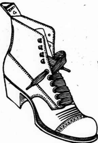
This is one of our most popular lasts for young men. Blucher cut. In both Gun Metal and Tan. Price $3.50 the Pair.