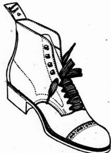
This style of shoe is fast coming into favor with well-dressed young men. Price $4.00 the Pair.