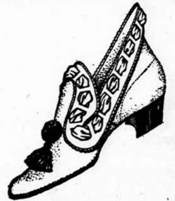
Ladies' Ribbon Top Bedroom Slippers. Very popular. Price $1.50 the Pair.