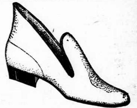
Ladies' plain Black Felt Bedroom Slippers at $1.00. This is a universal favorite with the ladies.

Jenkinson Brothers Company Kingstree, - - S. C.