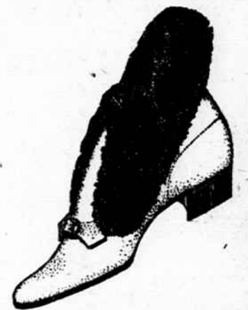
Ladies' Fur Top Bedroom Slippers, in Red and Black, at the popular price of $1.00 the Pair