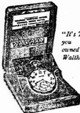
"It's Time you owned a Waltham"

Don't waste your money buying strengthening plasters, Chamberlain's Liniment is cheaper and better. Dampen a piece of flannel with it and bind it over the affected parts and it will relieve the pain and soreness. For Sale by All Dealers.