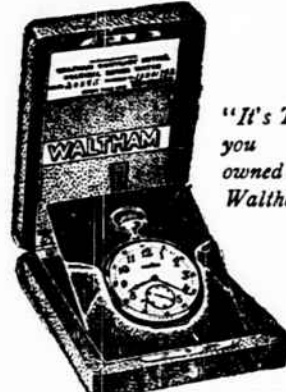
"It's Time you owned a Waltham"