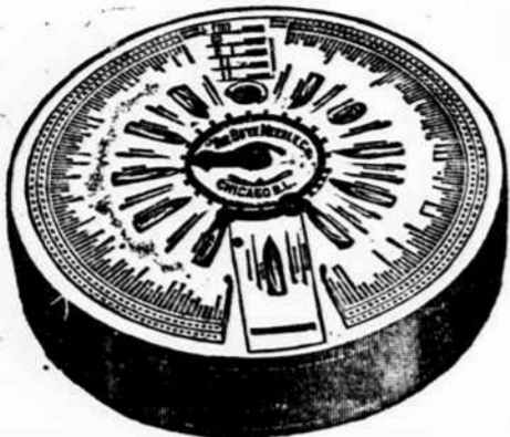
Needles, Shuttles and Bobbins for use in All Makes of Sewing Machines.

We carry the best line of SHOES and CLOTHING in Williamsburg county. We Guarantee all of our high-grade Shoes and Clothing.