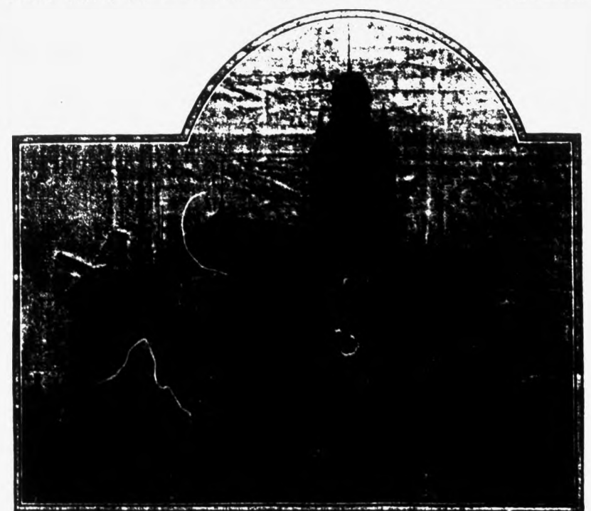
City Hall and Theatre.