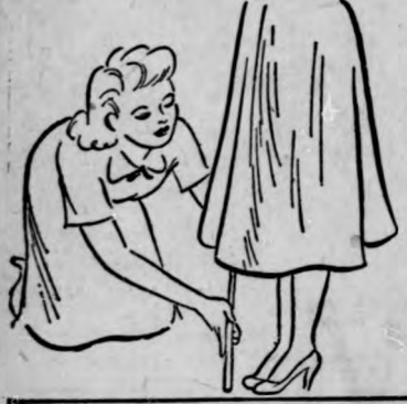
Shorten your old skirts . . .

Whatever is done to the full skirt should be done with consid-