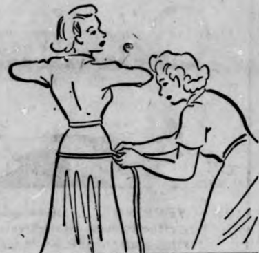
Stitch down pleats for new fashions.

If much shortening is needed, you'll have to cut the material so