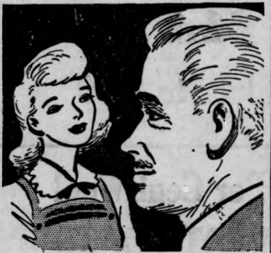
... in love with her guardian . . .