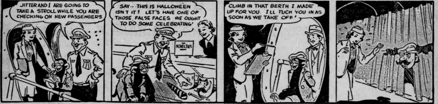
JITTER By Arthur Pointer "JITTER AND I ARE GOING TO TAKE A STROLL WHILE YOU ARE CHECKING ON NEW PASSENGERS"