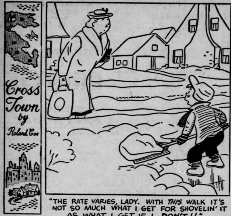
Cross Town by Roland Cox "THE RATE VARIES, LADY. WITH THIS WALK IT'S NOT SO MUCH WHAT I GET FOR SHOVELIN' IT AS WHAT I GET IF I DON'T!!"