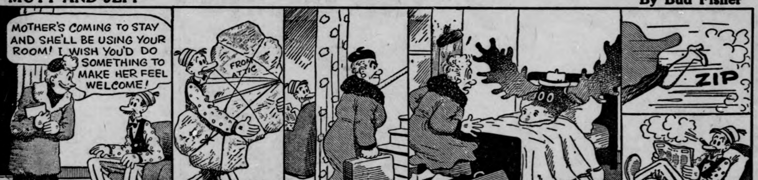
MUTT AND JEFF By Bud Fisher "MOTHER'S COMING TO STAY AND SHE'LL BE USING YOUR ROOM! I WISH YOU'D DO SOMETHING TO MAKE HER FEEL WELCOME!"