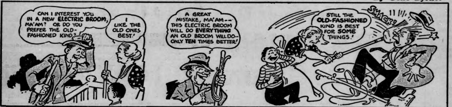
REG'LAR FELLERS By Gene Byrnes "CAN I INTEREST YOU IN A NEW ELECTRIC BROOM, MA'AM? OR DO YOU PREFER THE OLD-FASHIONED KIND?"