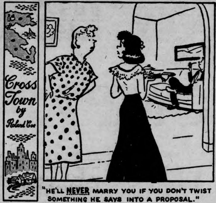
Cross Town by Roland Cox

25c for FULL SIZE Picnic Table No. 22 to Easy-Build Pattern Company Department W, Pleasantville, N. Y.