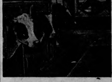
Picture on Vernon Julius farm at Freeport, Ill., shows installation of automatic cooling unit in dairy barn.

These automatic ventilation units, easily installed, reduce condensation.