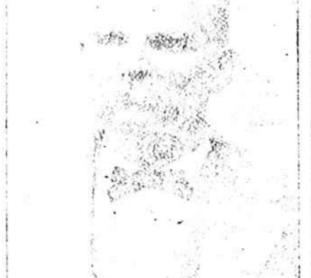
M. B. CROMER.

Persons have been known to gain a pound a day by taking an ounce of SCOTT'S EMULSION. It is strange, but it often happens.