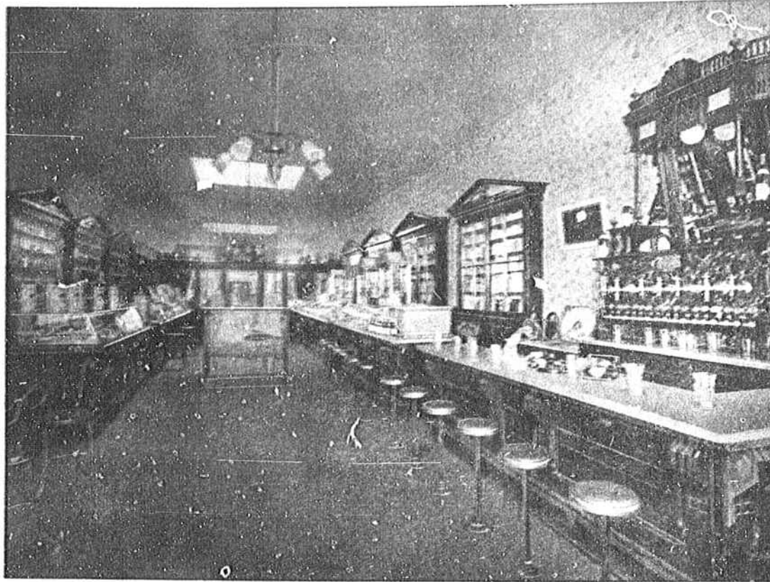
INTERIOR OF PELHAM'S PHARMACY.

The Prescription Department is up-to-date. None but high grade chemicals and analyzed drugs being employed in the compounding of physicians' prescriptions. Work turned out by this establishment is of the highest order of exactness and accuracy.