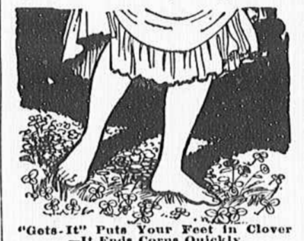
"Gets-It" Puts Your Foot in Clover—It Ends Corns Quickly.

Two Drops of "Gets-It" Will Do It. Ever hand-carve your toe with a knife trying to get rid of a corn? Ever use scissors and snip off part of the corn too close to the quick? Ever pack up your toe with "contraptions" and plasters as though you were packing a glass vase for parcel post. Ever