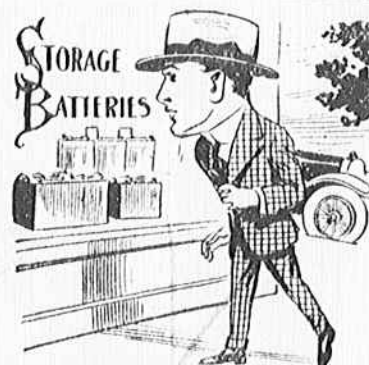
OUR STORAGE BATTERIES.

Late, retarded functioning throws the whole day's duties out of gear. Keep the system cleansed, the appetite lively, the stomach staunch with Dr. King's New Life Pills. Mild and tonic in action. Sold everywhere.