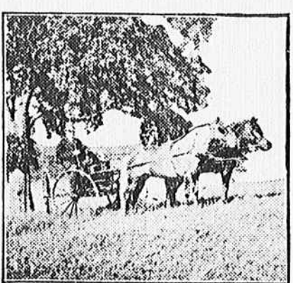
Handy Team Around Farm.

In winter only a rough shelter is needed for the sturdy creature. The Shetland has a heavier coat of hair than any other domesticated animal;