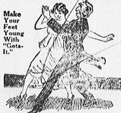
Make Your Feet Young With "Gets-It!"

"Really, I never could see how some few people use the most difficult and painful way they can find to get rid of corns. They'll wrap their toes up with bandages into a package that fills their shoes full of feet and makes corns so painful they've got to walk sideways