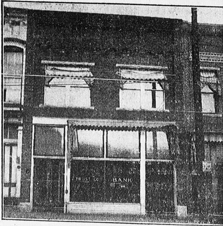
FARMERS NATIONAL BANK.