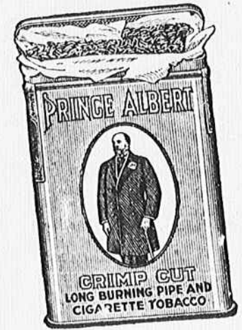
On the reverse side of this tidy red tin you will read: "Process Patented July 30th, 1907," which has made three men smoke pipes where one smoked before!