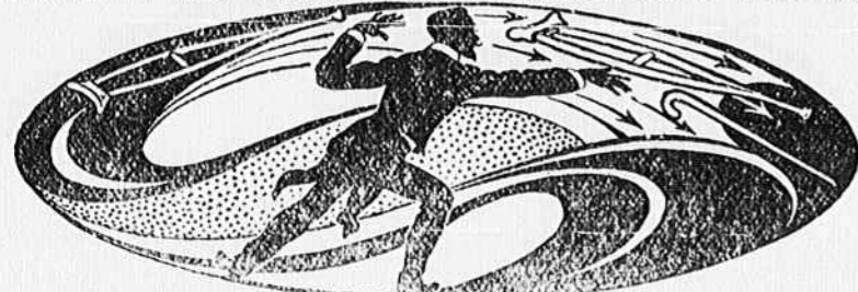
S. S. S. is a Regular Wizard in Driving Out Rheumatism.

Action in the Tissues of a Remarkable Antidote