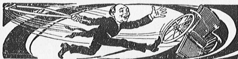
In S. S. S. You Get a Twist on Rheumatism that Settles It.

Makes Short Work of Cleaning Out Your Entire System—Aches and Pains Go Fast.