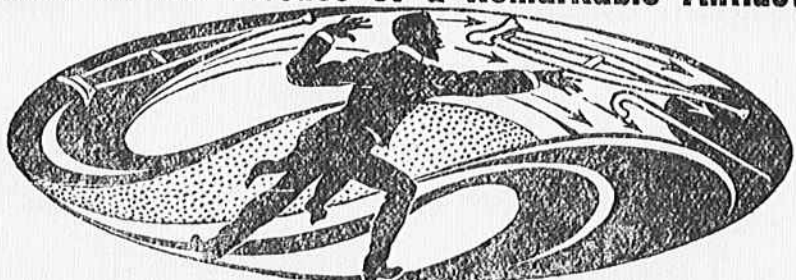
S. S. S. is a Regular Wizard in Driving Out Rheumatism.

Action in the Tissues of a Remarkable Antidote