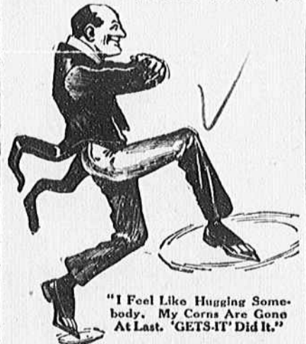
"I Feel Like Hugging Somebody. My Corns Are Gone At Last. 'GETS-IT' Did It."

Now try the different way, the new way, the absolutely sure way, the painless way of getting rid of those corns that have pestered the life and