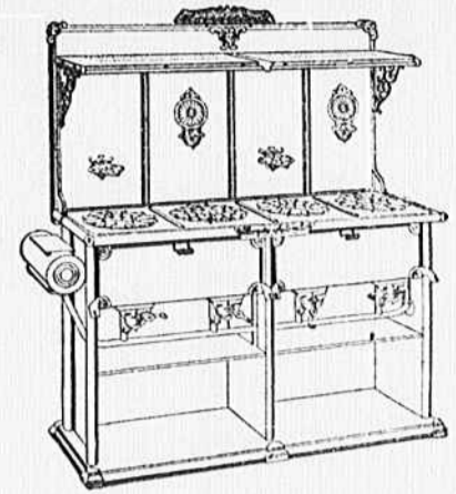
Oil Stoves from $7.50 up.

Help to make life more pleasant during the Hot Season. We are showing a complete line of the best makes at remarkably Low Prices.