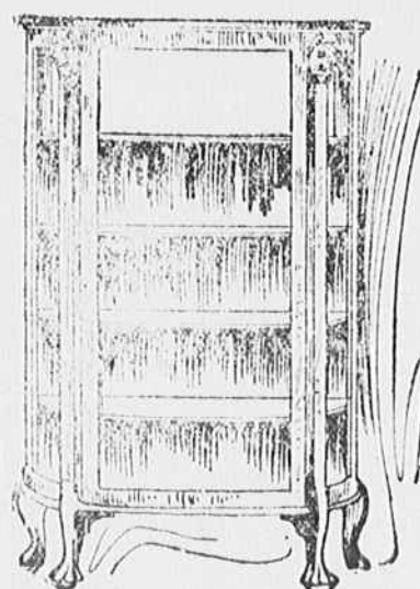
Full Quarter-Sawn Oak China Closet $25.00.

A strikingly handsome piece of furniture, this Dresser of true Colonial design—rich, quartered golden oak—top 45x22 inches—86x30 inch French bevel plate Mirror—three large and three small drawers—all have wooden knobs—the article is thoroughly well made and finished, and a striking example of exceptional value at $25.00.