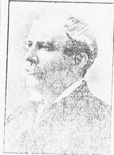
GEN. M. C. BUTLER.

the Confederate armies. The reports of Sheridan himself attest the splendid fight of Butler and his brigade at Hawe's shop and Cold Harbor. At Trevillian station he was in command of Hampton's division, and repulsed seven distinct and determined assaults by the largely superior forces under Sheridan, his command occupying the most important point of a Confederate line and fighting as infantry. In September he was promoted to major general and in 1865 he was detached with a small division for the campaign against Sheridan in the