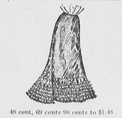
48 cent, 69 cents 98 cents to $1.48

35c bottle Charles H. Fletcher's Castoria, 29 cents. 25c bottle Chamberlain's Cough Syrup (good) 19 cents. 25c bottle White Pine and Tar, 19c. Two big Cakes, Victory Soap, 5 cents. One big package Washing Powders, 4 cents. Fifteen hundred Searchlight matches 10 cents. One thousand matches, Gee Whiz, 5 cents. Needles, pins, key chains, 1 cent. One Beats A11 lead pencil, 1 cent. Five thousand yards fine quality Gingham, worth 5 cents per yard, our price 3 cents. Special Ribbons sale at Red Iron Racket. Wide Goods, all silk, "red hot" 10 cents per yard. Extra big values Ladies' Underwear, Knit Shirts and Pants at 23 cents, 39 cents, 48 cents.