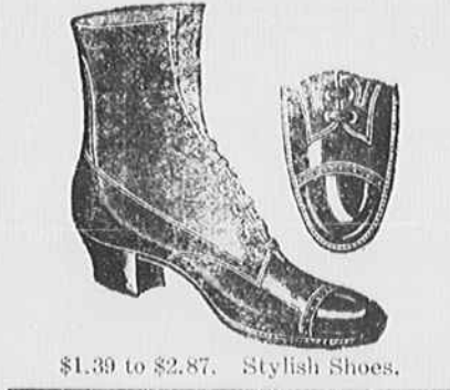
$1.39 to $2.87. Stylish Shoes.

It is a strain for you to look for Bargains in other houses, where they are few and far between. It is easy for you here where the Bargains are so Plentiful, that wherever you turn they are looking at you, Same Goods Less Money.