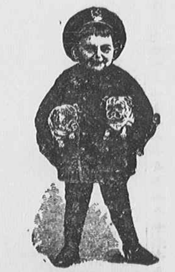
We are always on the look out—high prices don't come near here.

Keep this "Red Hot" Sheet for Future Reference