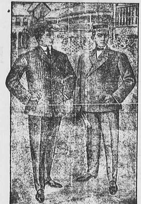
Special Clothing Sale now on at Red Iron Racket. All Clothing to go at Red Hot Prices.

Dry Goods, Notions and Racket Goods, Ladies' Ready-to-wear Cloaks, Jackets, Dress Skirts, Underskirts, Shirtwaists, Underwear, Hosiery, Blankets, Bed Quilts, Table Covers, Men's Dress Shirts, Work Shirts, Fancy Vests.