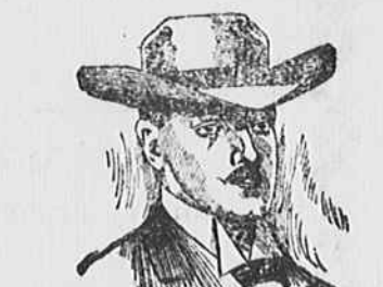
Stylish Hats for Correct Dressers, 98c, $1.39 to $3.47