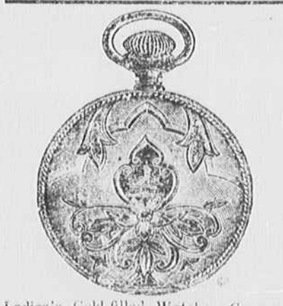
Ladies' Gold-filled Watches Guaranteed 20 years. Elgin movements $12.97.