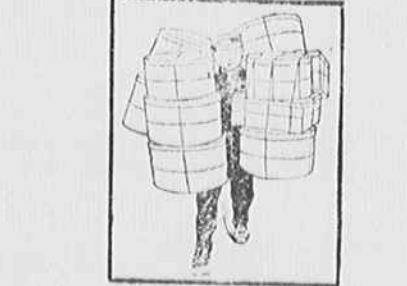
I've Bin to Red Iron Racket Man, You go there too