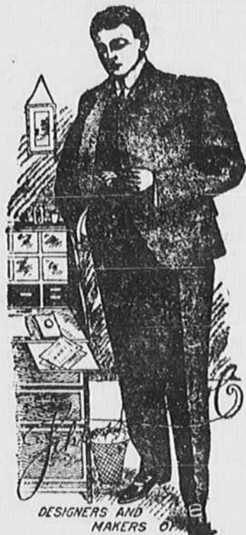
DESIGNERS AND MAKERS OF

The difference between a suit you buy of us and one you buy of a merchant-tailor, is simply a difference in price, and not in value. You pay $5.00 to $15.00 more for your merchant-tailor suit than we would ask you for same suit. In Fabric, Tailoring, Style and Fit none can beat what you buy of us.