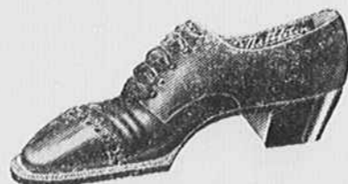
Customers' Shoes Shined Free

Thoroughly high grade products and broad gauge business principles have made our name stand for the best.