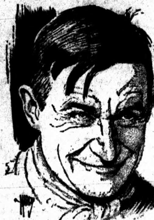
Another "Bull" Durham advertisement by Will Rogers, Zig-zag editor and screen star, and leading American humorist. More coming. Watch for them.

The BULL'S EYE is a publication that goes to print. When does it go to print? It goes to print when ever there is something to print.