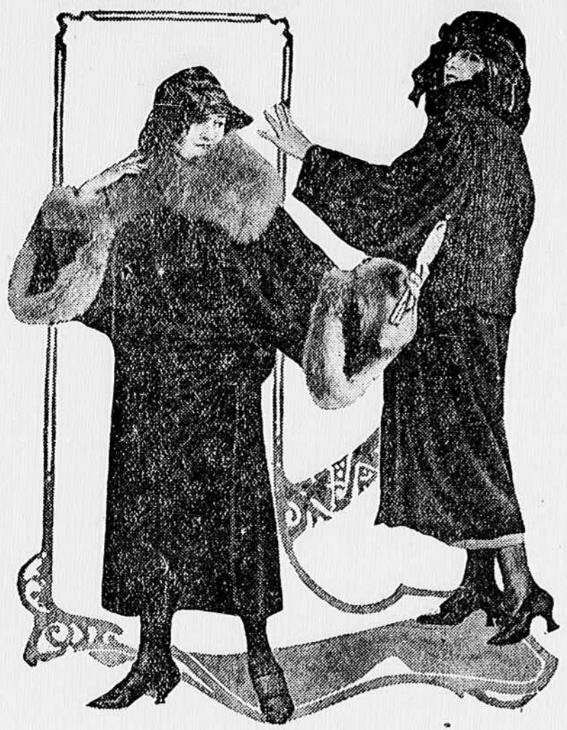
Two Models in the Prevailing Style.

gown tuned to the demands of club affairs, receptions and smart restaurant after-theater parties, velvet answers in responsive chord. Soft, supple chiffon velvet "costly as thy purse can buy, rich not gaudy," of such is the fashionable dinner gown of today. Simplicity characterizes these semi-formal frocks. This trend of fashion is admirably demonstrated in the russet-colored velvet dinner gown here portrayed.