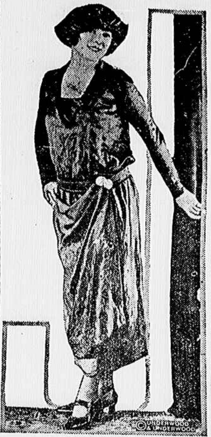
This is among the very latest draped skirts. It has long tight sleeves, patterned in fine gold thread, with the new long skirt of soft black satin for early autumn wear.

color such as some giant kaleidoscope might give. It is the more delicate, flower-like shades which are chosen for these picturesque hats, the mauves, the roses, the eucalypt and fuchsia tones, the clear bright yellows, with almond green, pale beige and biscuit tints, or dainty gray, with plenty of white and here and there a note of black for contrast. There is even an occasional note of clear light blue, always a dangerous color for anyone over sixteen and even now, more often seen in the milliners' salons than on the heads of their clients. The whole range of golden browns is also seen, for these shades are irresistibly becoming.