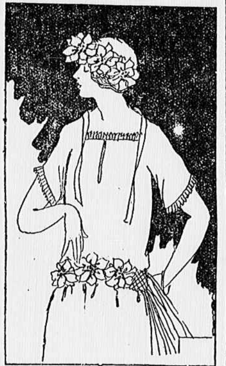
New Girdle and Hat of Braided Straw and Red Poppies, Worn With Simple Cotton Crepe Frock.

With their simple cotton and crepe georgette dresses young women with a love for the picturesque are using