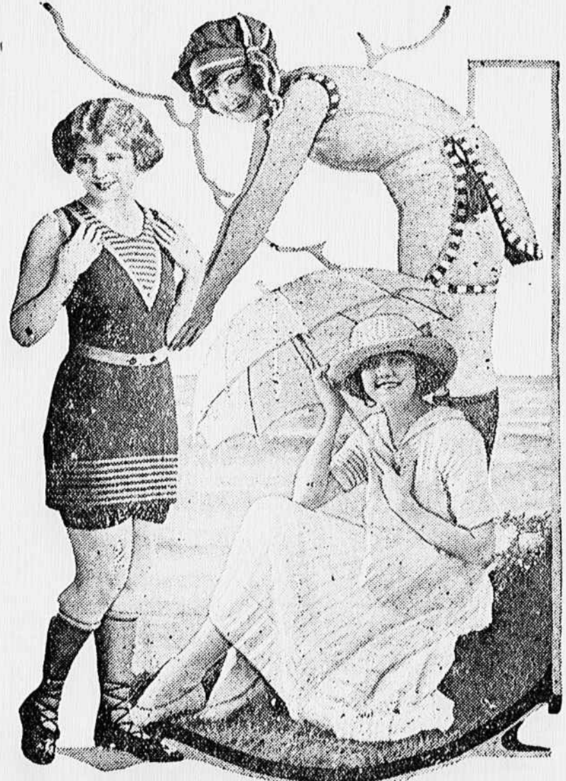
Pretty Bathing and Beach Costumes.

looking at. Some of the bathing suits are supplemented with them also; rather in high colors and with fanciful decorations, appears to be the best fabric for them. There are impressive outfits of this material, including a suit, cape, pillow and umbrella. Bathing suits predominate on the beaches, and ground fabrics in them are mostly quiet in color, the designs modest and becoming. Much attention is given to the neck line and many of them have cap sleeves. Jersey cloth is an ideal material for these with bodice and short skirt in one worn over knee-length bloomers or short pants. The picture portrays two practical swimming suits in knitted fabrics, one of them in dark blue with white stripes and one in gray with bindings or short pants. A suit of gray jersey