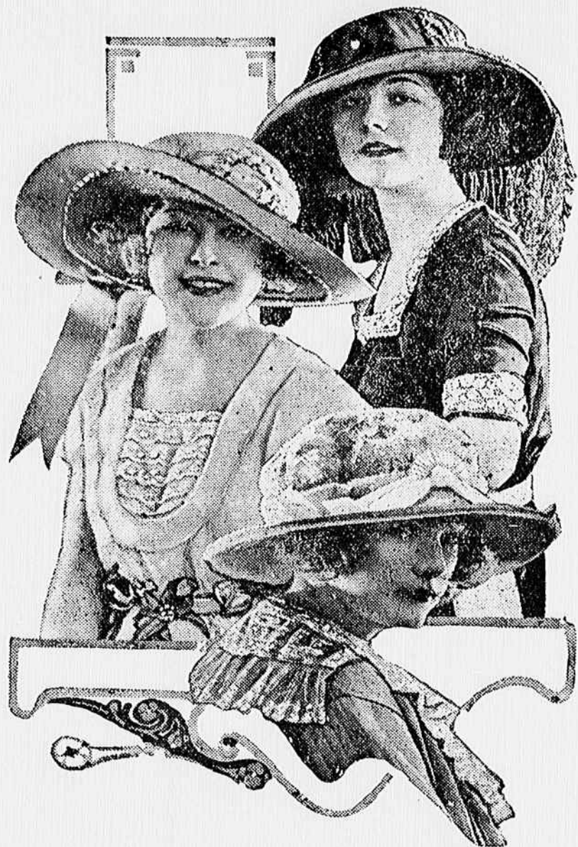
Some Pretty Ideas in Neckwear.

On the beaches interest is divided between the clothes of those who go in the water and those who stay out, with bathing suits, swimming suits and outing dresses all represented. When out of the water the swimmers are fortified by enveloping capes that allow only glimpses of their trim garb, but then capes are well worth