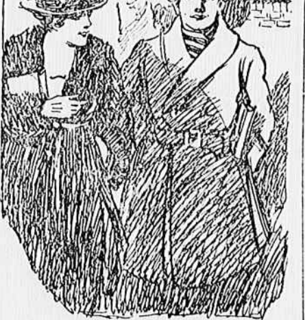
"I Never Liked Any Girl Enough to Go and Call on Her."

"And so cold and blowy!" she added. "It seems a long time ago, I like walking with you, Ramsey. You're so quiet and solid—I've always felt I could talk