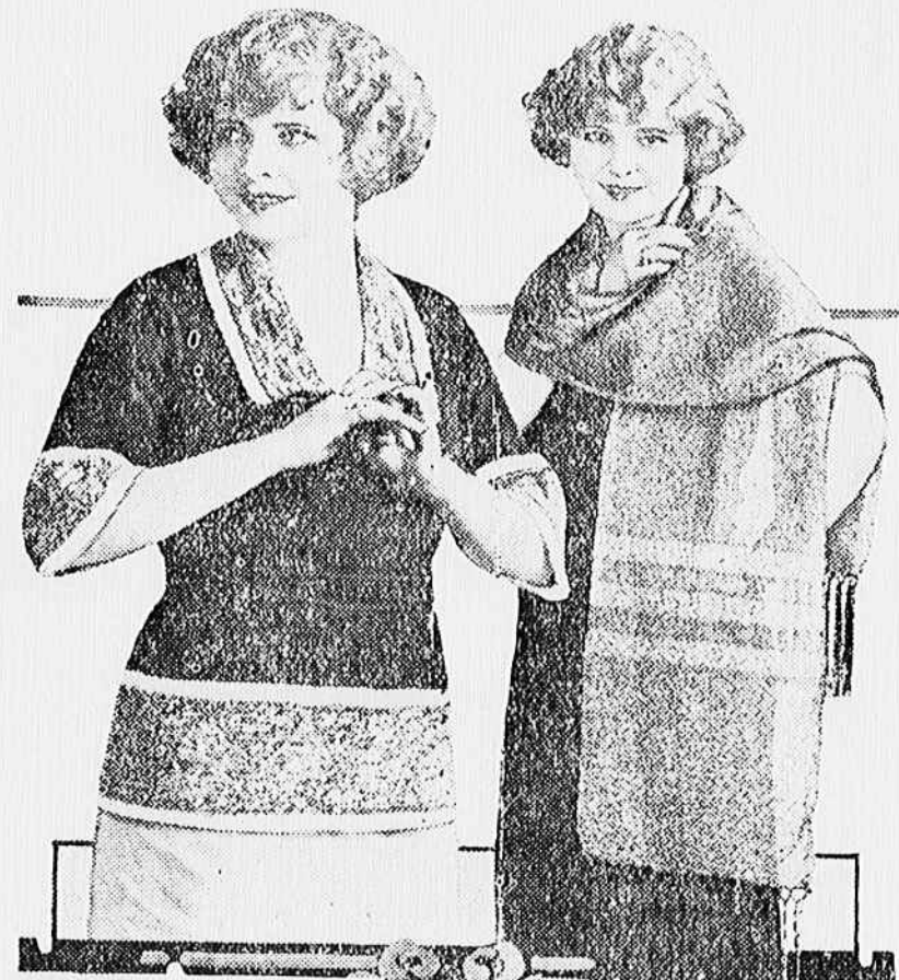
Slip-Over Sweater and Scarf.

A novice might make a beginning in the gentle art of knitting by copying the pretty scarf of Iceland wool shown here at the right of the illustration. A fine zephyr, in any color desired, is used for it and the border of stripes