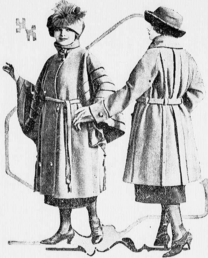
Practical Wraps for Summer Journeys.

Knitted things, including dresses, are especially voguish for sportswear,