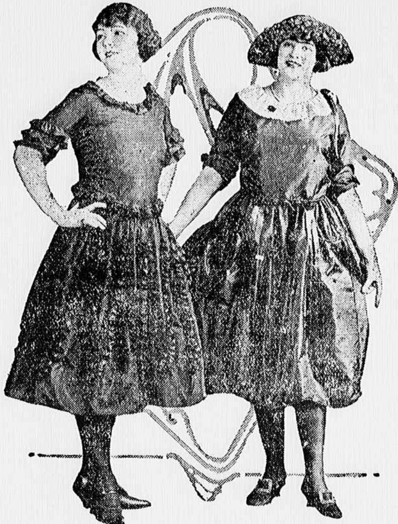
For Affairs of Afternoon.

It is a silken mode this season, with emphasis put upon simplicity of design and trimmings. But replicas of silk garments, made of sheer, silky cottons, are less expensive and dainty enough for the most exacting taste—while there are still many women who