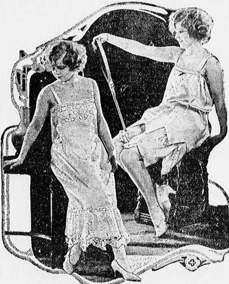
Latest Ideas in Undergarments

Step-in drawers of grenadine crepe de chine, with chemise to match, appear with a tailored finish of points instead of the usual lace trimming. Among the novelties recently arrived there are bodices of net or radium silk, with vestees of net and filet, or val lace insertions, which do away with the necessity of a blouse under summer coats. Sleeveless nightgowns have deep armholes edged, like their