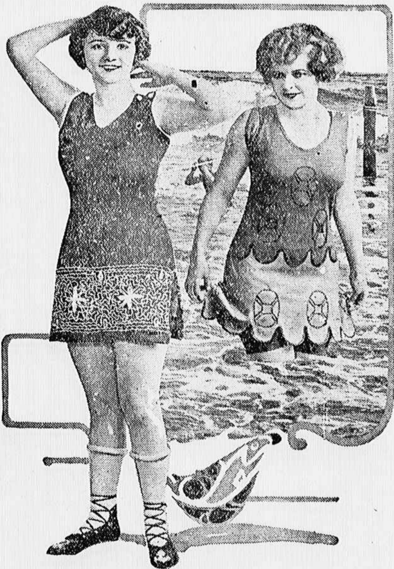
For Surf and Sand.

their neck openings and the treatment of the arm's-eye. Color and color combinations also lend them interest. The suit pictured is in dark blue piped with white, and has a V-shaped neck opening. It fastens with buttons on the left shoulder and has separate trunks. Jersey cloth in a two-color combination makes the suit for a young girl. It has a semi-fitted body and the trunks are joined to the overgarment which fastens on the left shoulder. The arm's-eye is built out with a fold of the lighter colored jersey. This youthful suit makes possible many pretty color combinations and is very