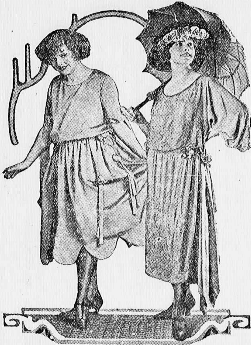
Two Pretty Afternoon Models.

These models show variations that are worth considering, in the shape of