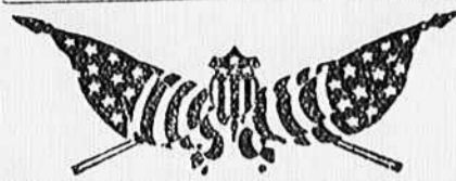
"My Country 'Tis of Thee, Sweet Land of Liberty."