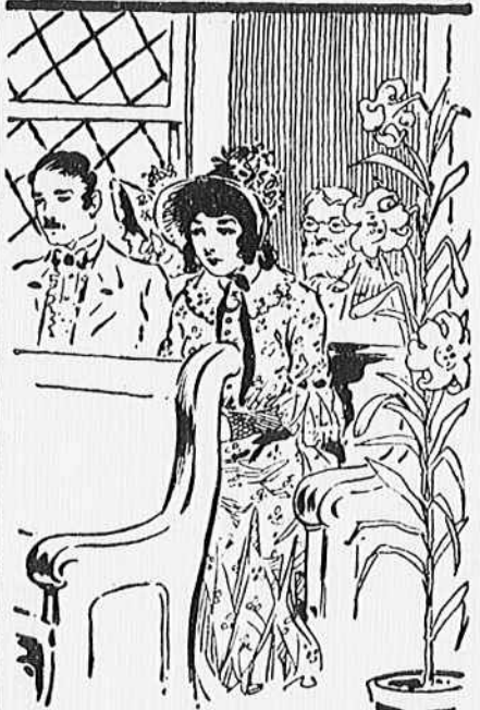
Again the Words of the Easter Text.

slow-gathering tears of age; straightway a bundle of chiffon and satin shook itself away from her lap and a tender little rosebud face framed in a crushed, beruffled little bonnet of dainty rose pink looked lovingly into hers. "Granny crying?" she begged. "Little Anne naughty? Little Anne sorry; don't cry, granny." "Granny" Anne of seventy smiles through "I am the resurrection and the life." It is "Mistress Anne" now, if you please, in the old family pew; her husband on one side of her and her children on the other like heads upon a lily stalk, who smiles in happy thought. How Jack had laughed at her coquettish confession that she had chosen black for her new Easter gown since she was afraid she was too old now for gay, bright colors. (As if the new Easter dress had not been chosen as a special test of becomingness, with its long, slender polonaise and perky little bows everywhere over the shirred, puffed, bouffante underskirt!) There