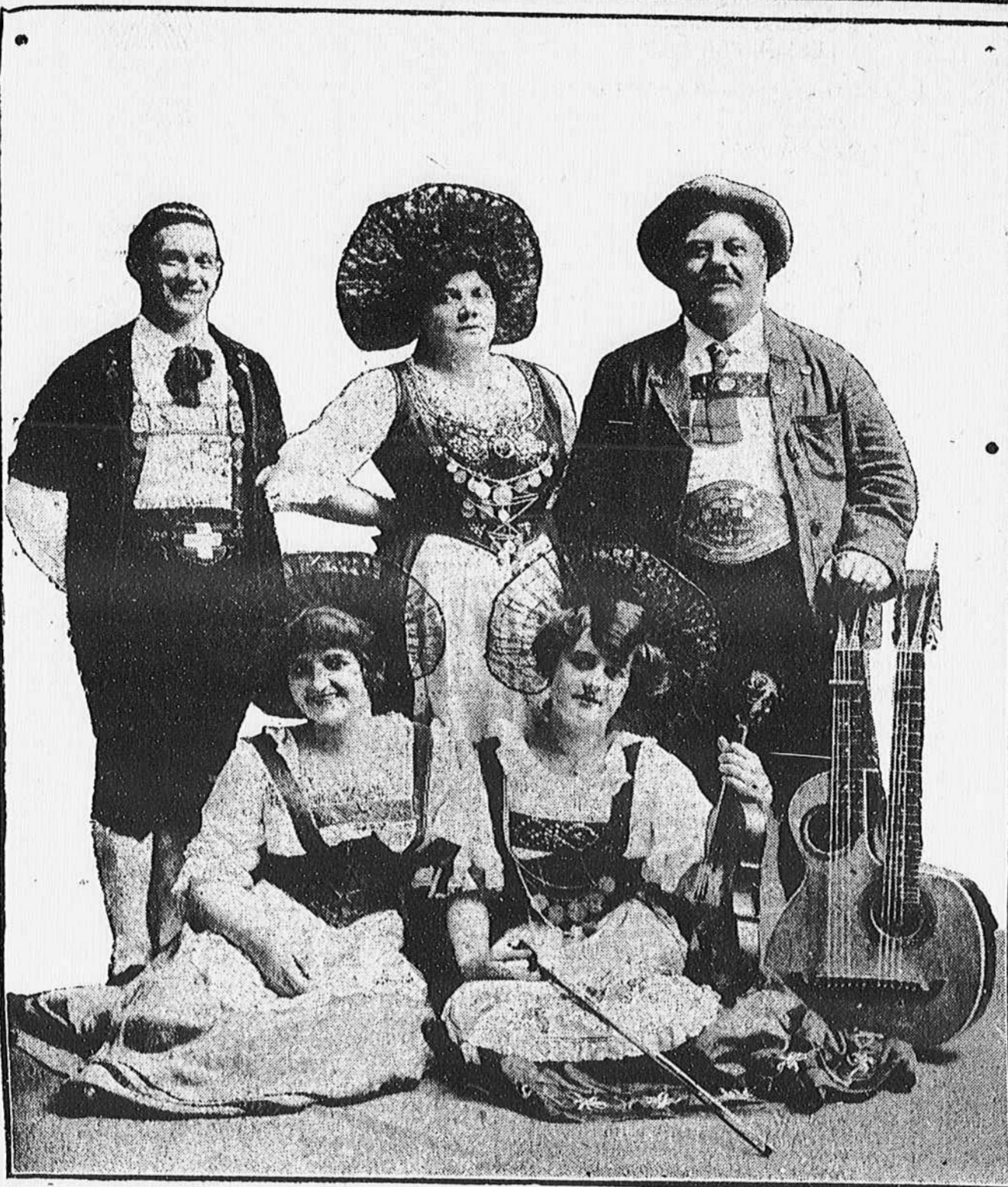
Tryolean Alpine Yodlers—One of the Closing Day Attractions

PICKENS, S. C. : JULY 8-9-10-11 Make Your Arrangements to Come