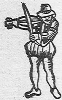
For Musical Instruments, go to Trammell's Music Palace, Pickens.